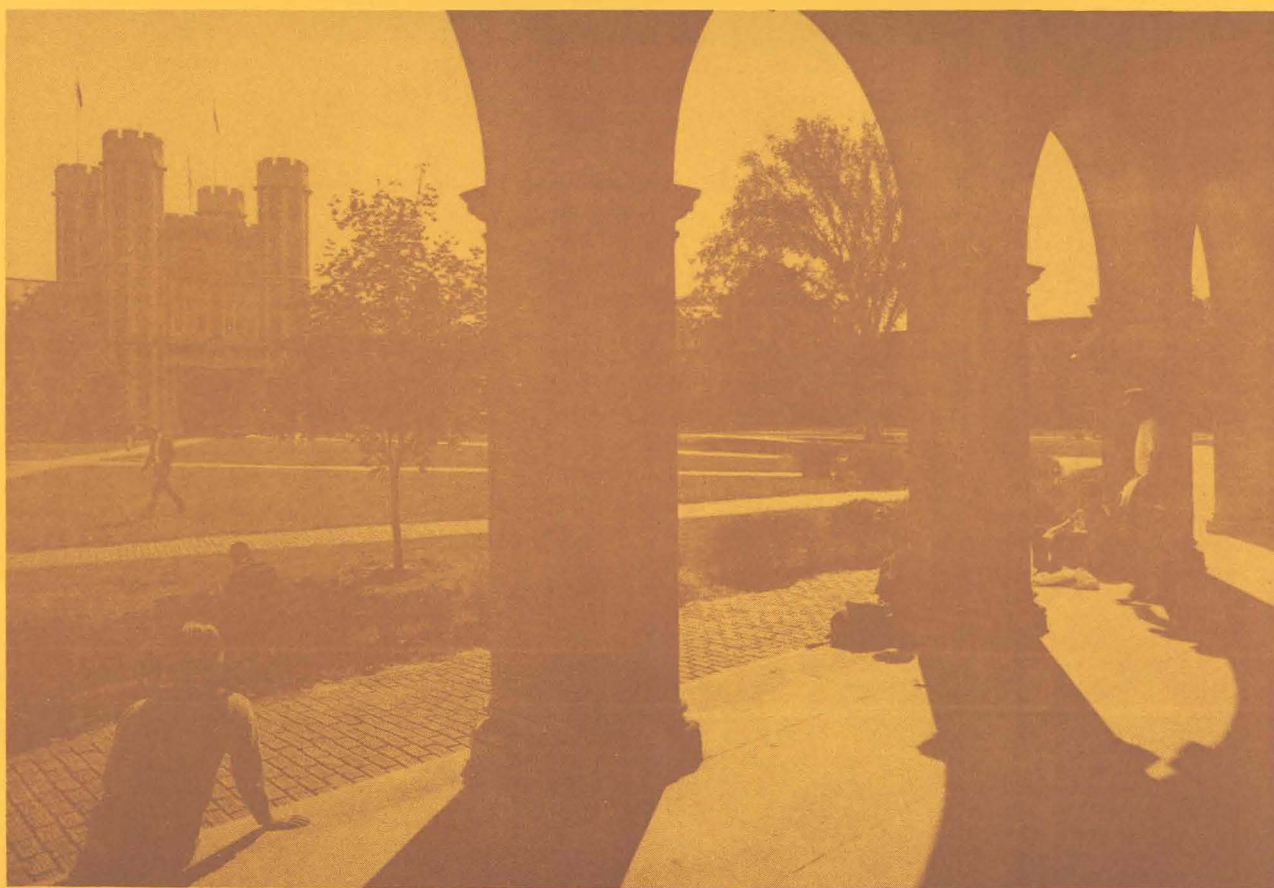
Washington University Quadrangle Main Campus